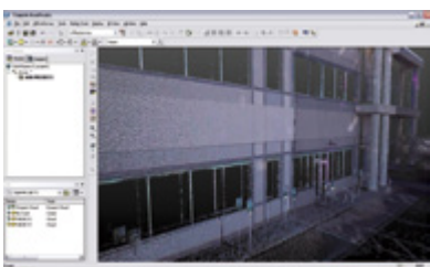
3D data inside Trimble RealWorks software

The Trimble® CX Scanner is an advanced 3D laser measurement instrument designed to provide highly accurate data acquisition capabilities. Integrating the flexible processing capabilities of Trimble Access™, the Trimble CX system provides a series of advantages for your project management, starting with the ability to perform QA/QC in the field by providing station-based reporting and 3D point cloud visualization.